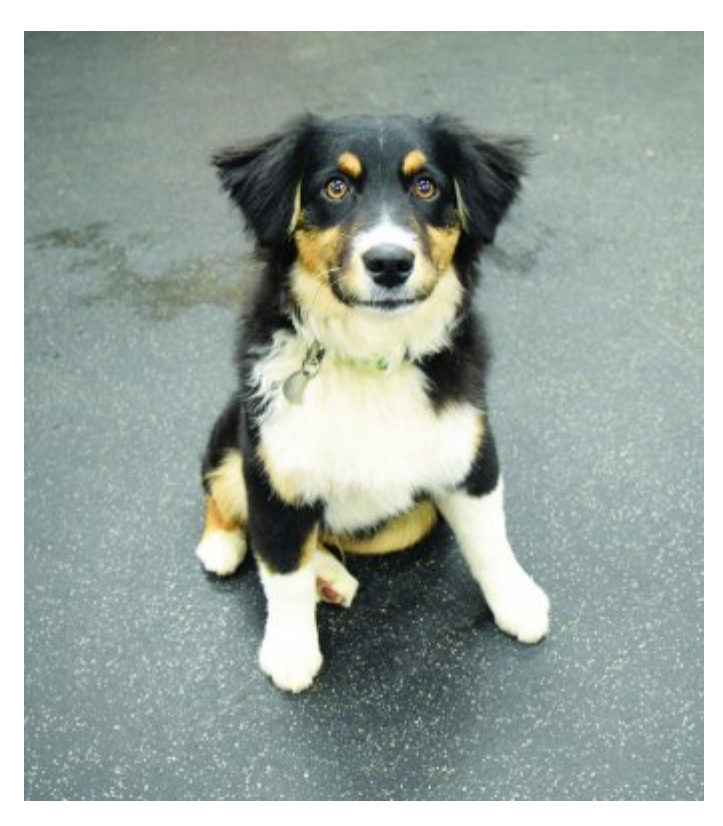
Powerful knowledge: The moment that a puppy learns that volunteering a "sit" can reliably cause her person to deliver a treat, she is on her way to learning everything she'll need to live with humans.

Recalls (coming when called) may just be the single most important behavior you can teach your dog. A dog who has a solid recall can be