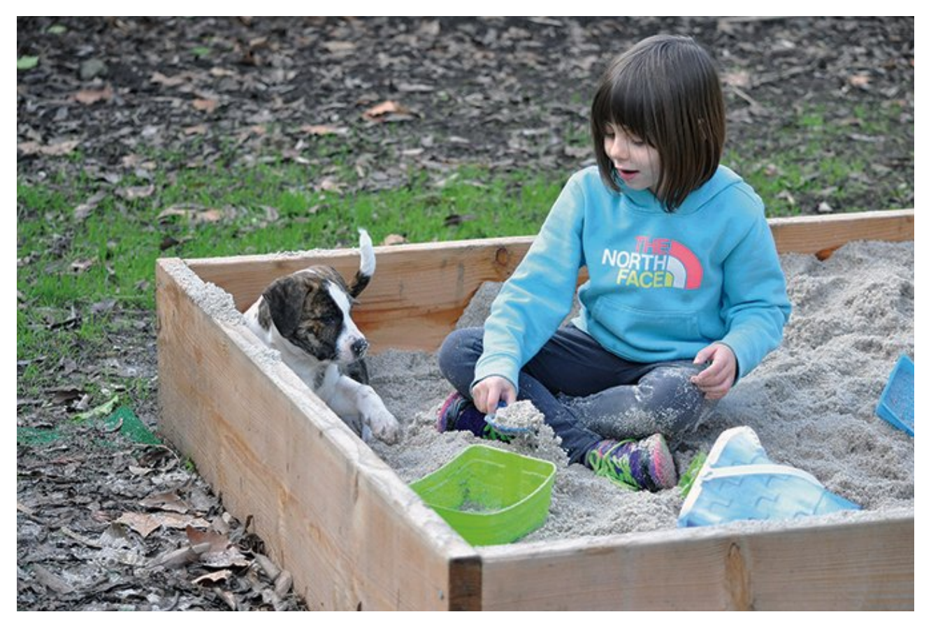
Ideally, whoever owns or cares for your puppy's mom starts a positive socialization process, and you continue it immediately upon adoption! It's much more effective to socialize a pup early on than try to provide remedial socialization.