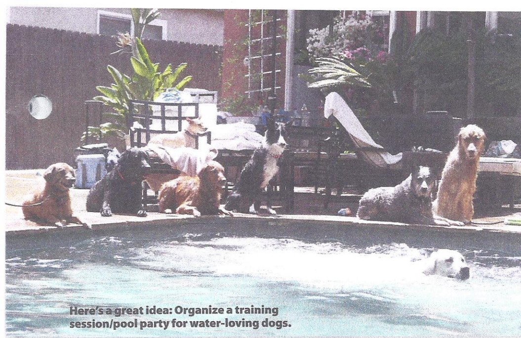
Here's a great idea: Organize a training session/pool party for water-loving dogs.