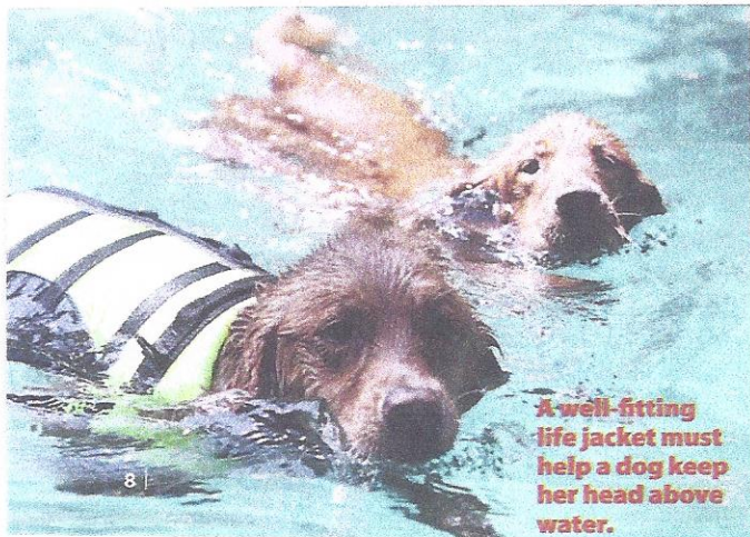
A well-fitting life jacket must help a dog keep her head above water.